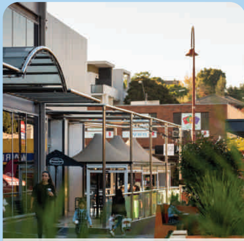
Improvements to street-facing outdoor dining areas ✓

Head to banyulebusiness.com.au/grants for a list of FAQs