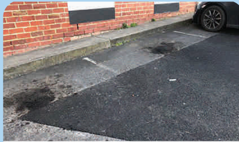
Improvements to privately owned car parks in areas of high public use ✓