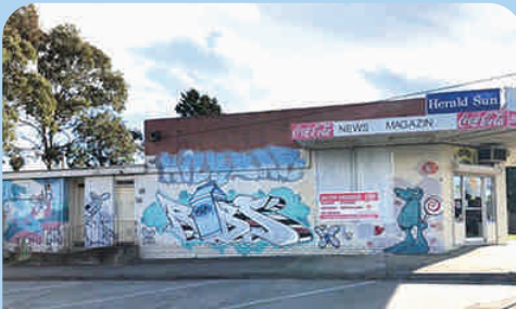
Improvements to building facades in areas of high public use ✓