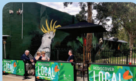
Improvements to building facades in areas of high public use ✓