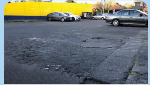
Improvements to privately owned car parks in areas of high public use ✓