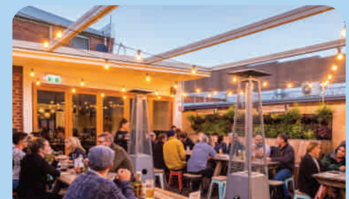
Improvements to non-street facing courtyards ✗